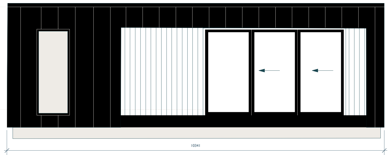
Example Front Elevation